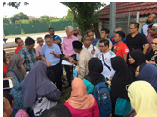
MIHA participated in the 'OSH in school' programme, successfully organised by MSOSH