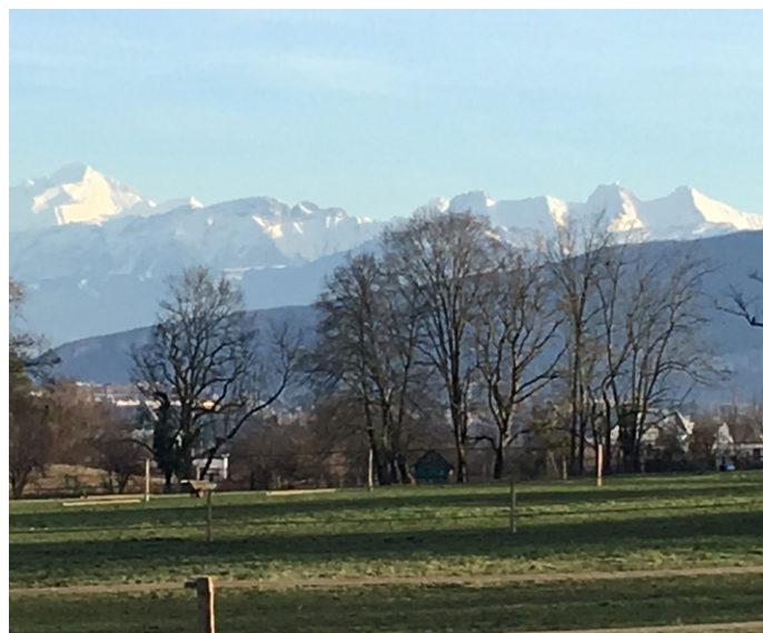
The ILO meeting took place in Geneva

There may be an opportunity for IOHA to be a participating member, but there may be restrictions due to limitations put on