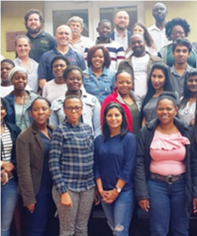
Striking a pose – Participants and presenters of the International Course in Occupational Hygiene, hosted by SAIOH and DUT, 4-7 December 2017

The training course, which was CPD-accredited by SAIOH and the South African Institute of Occupational Safety and Health (Saiosh) for their respective members, was attended by occupational hygienists and other occupational safety and health (OSH) professionals, including environmental consultants.