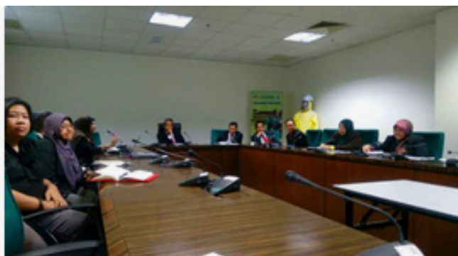
MIHA committee members held a courtesy visit to DOSH office to strengthen collaboration